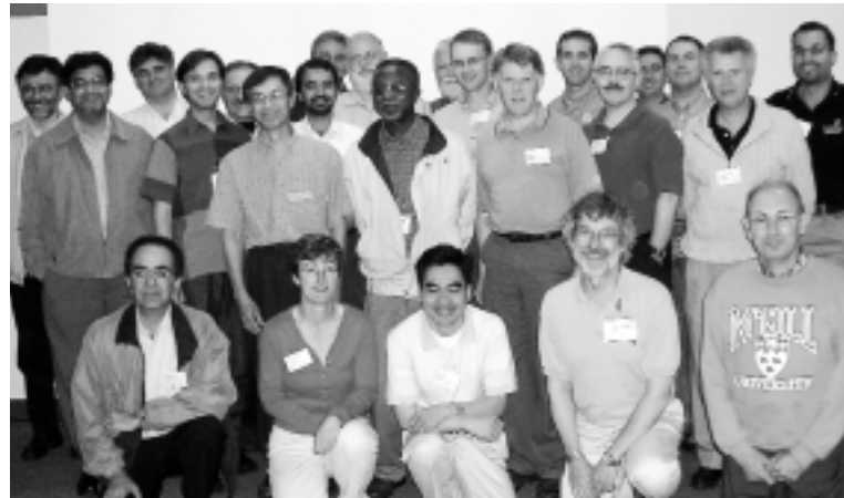
Engineering professors from across Canada and industry representatives participated in the 2004 CSChE Summer Institute on Industrial Safety and Loss Management this spring in Sarnia, Ontario.

In addition to Minerva Canada, the Summer Institute received financial sponsorship from the following organizations: Canadian Society for Chemical Engineering (CSChE), Canadian Chemical Producers Association, NOVA Chemicals, Imperial Oil, LANXESS (formerly Bayer), Irving Oil, Interquisa Canada, Health Canada, Recochem, BASF, Dow Chemical, Environment Canada, Royal Polymers, PetroCanada and the Workplace Safety